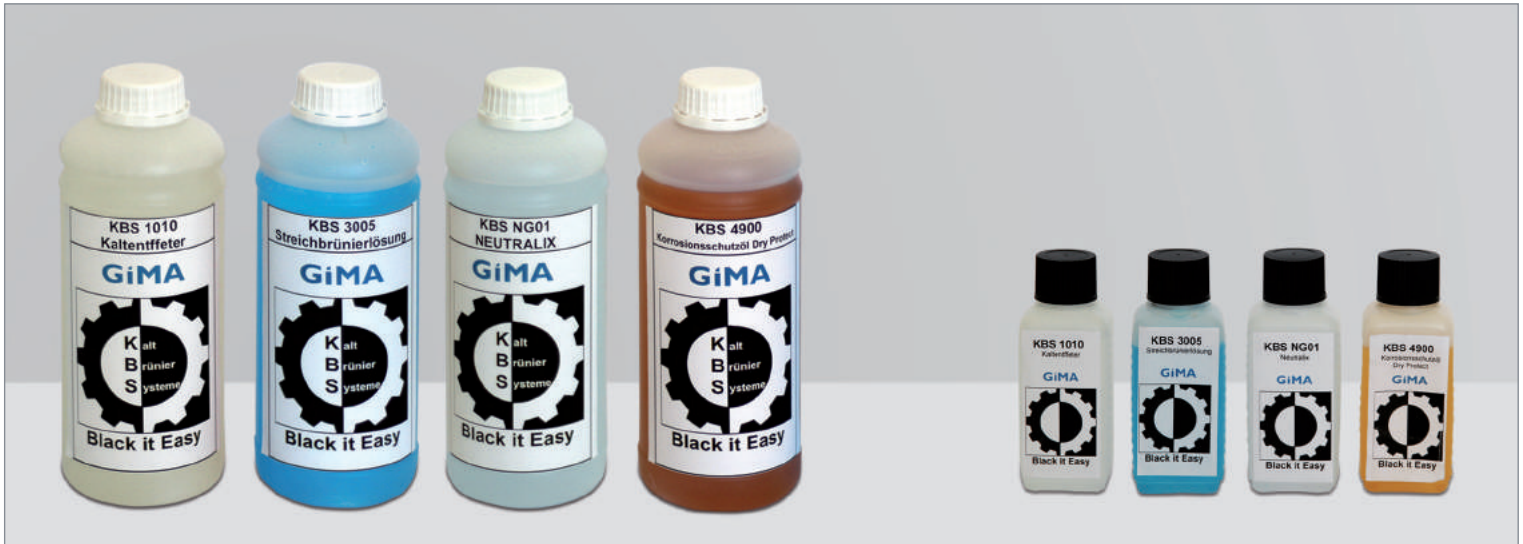
In 1 l or 100 ml bottles, similar to those pictured