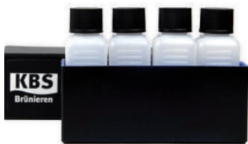
The KBS 100 ml burnishing sets are supplied in practical storage boxes, with 1 l to a carton